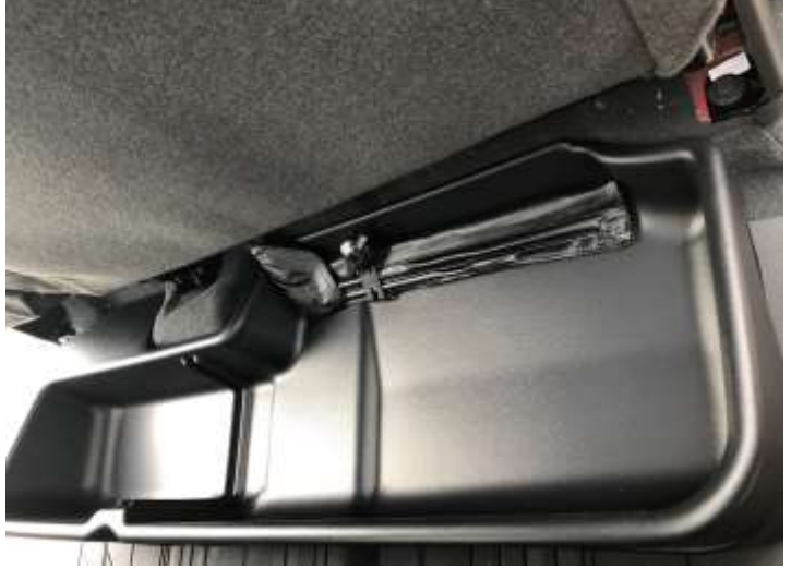
FIGURE 4 FIGURE 5

8) Install the divider and you are ready to organize. If you are storing long items it may be necessary to remove the divider.